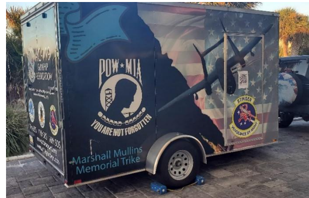
Trailer for The Robeck’s Memorial Trike