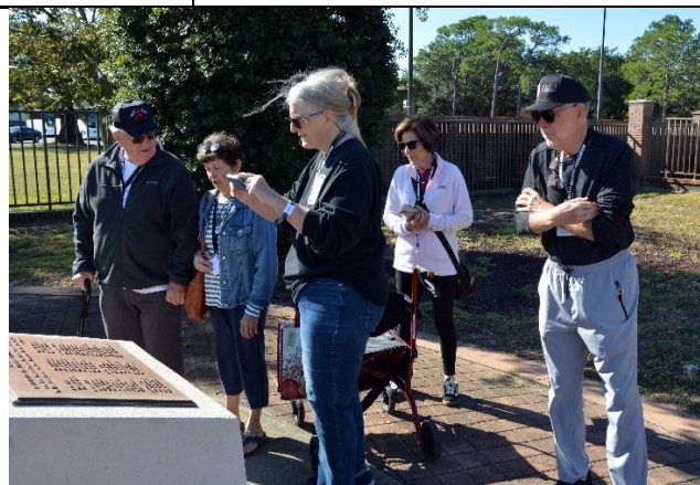
Hurlburt Air Park, Memorial to Lost AC-130 Spectres