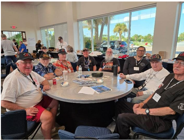
Hootch is open and friends are gathered