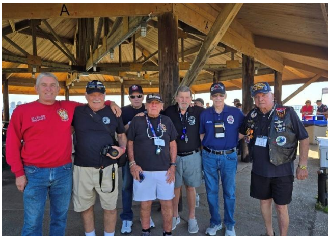
Navarre Park Meet/Greet – THANK you - 18 th SOTES hosts