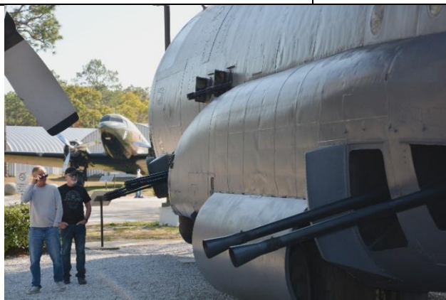
Eglin Armament Museum, AC-130A "First Lady"