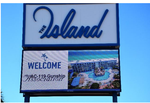
Island Resorts, Welcome AC-119ers