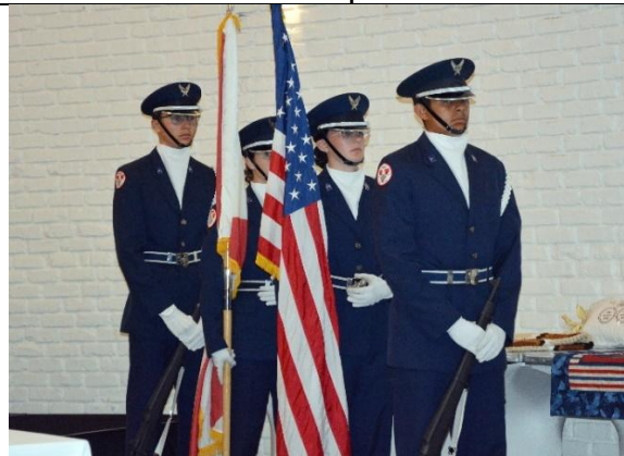
Junior ROTC Color Guard at Awards Banquet