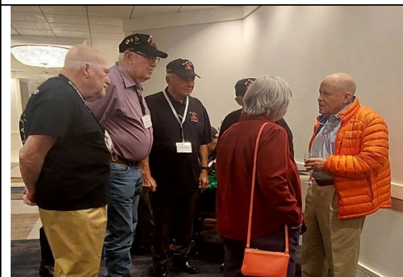
Stinger 41 meets former SECAF Whit Peters