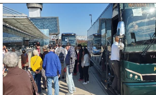
Bus to Smithsonian Museum at Dulles Airport