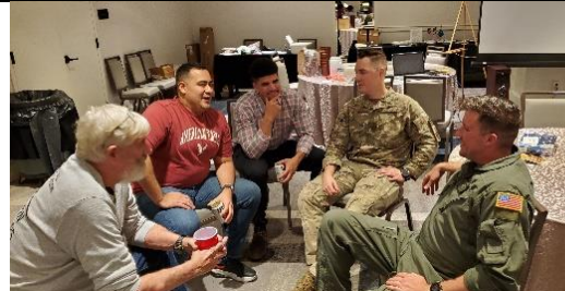
Swapping stories with Ghostriders