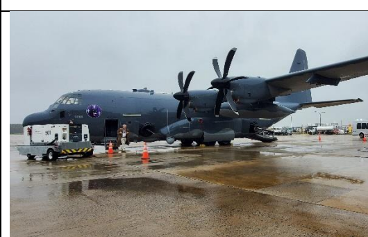
Former 17 th SOS "Jackal" AC-130J Ghost rider