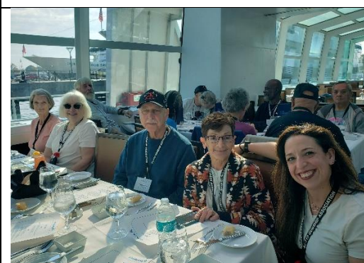
Lunch time – Potomac River cruise