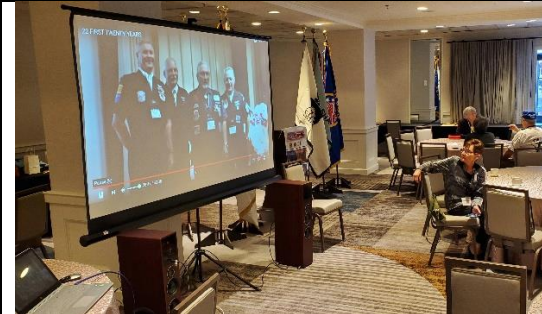
Hootch - new A/V system