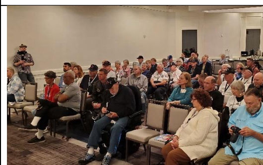
Sat. morning Business Meeting Attendees