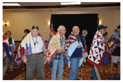
Proud AC-119 Brothers With QOVs.