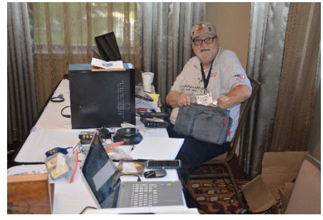
Ev at Media Central.