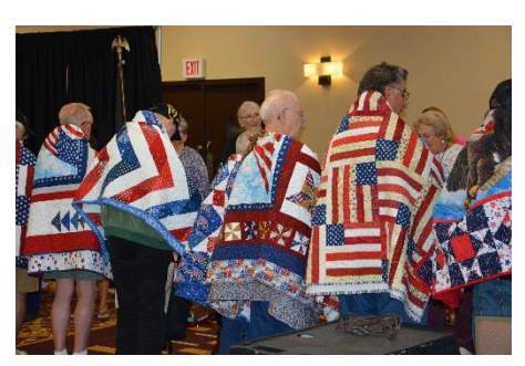
More Back Artwork of QOVs.