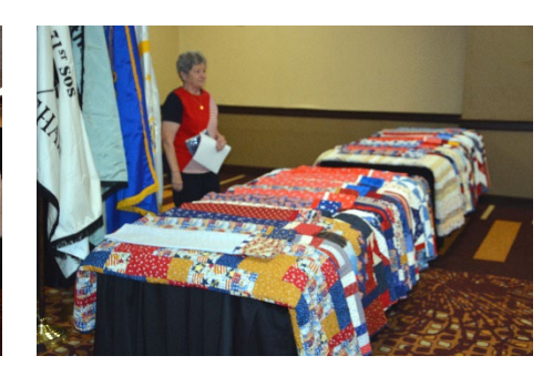
QOVs Awaiting Presentations