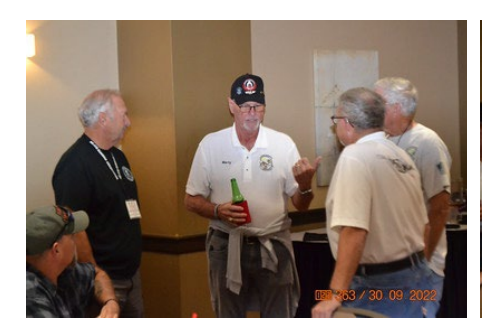
Gathering of the 119 minds.