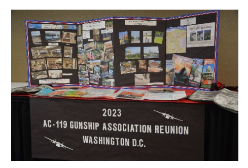
2023 D.C. Reunion Display.