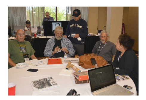
Hanging Out In The Hootch.