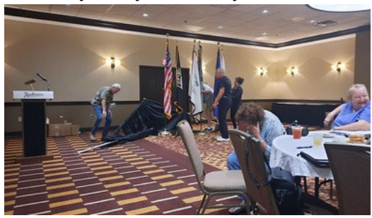
OOOPS! All Fall Down.