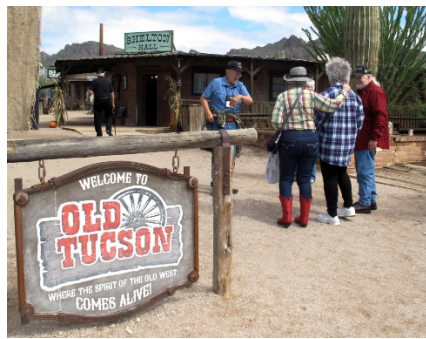
Old Tucson Studios Entry