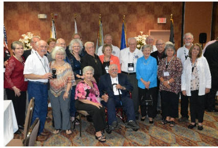
71st SOS Group