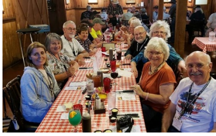
Hungry Crowd at Pinnacle Peak