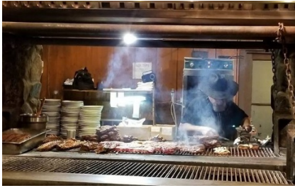
Pinnacle Peak Grill