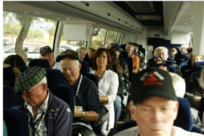
Bus On the Way to the Pima Air & Space Museum and Boneyard Tour