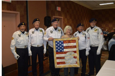
Banquet Color Guard