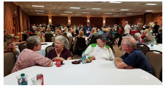
Meet and Greet