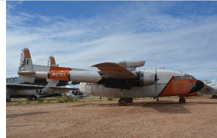
C-119G, Pima Air & Space Museum