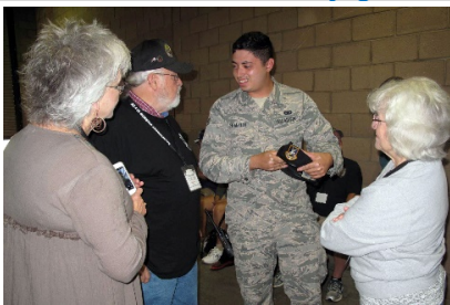
Security Checkpoint – Davis Monthan AFB Boneyard Tour