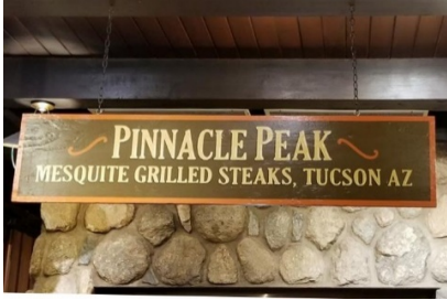
Pinnacle Peak Restaurant