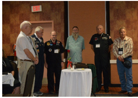
POW / MIA Table Ceremony