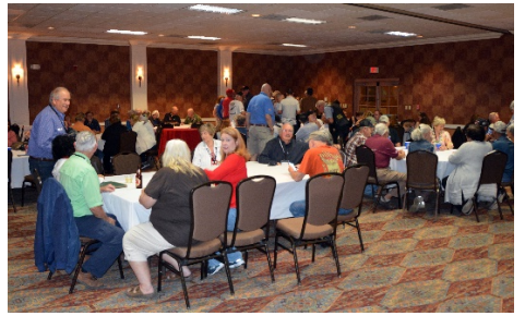
The Awards Banquet