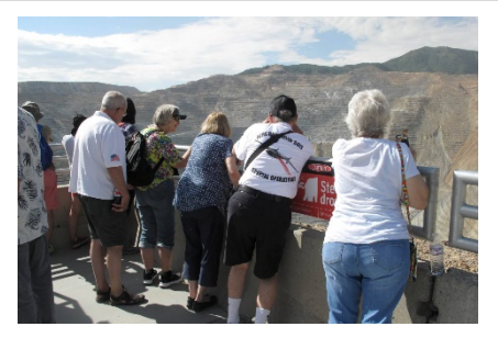
Viewing The Open Pit Copper Mine