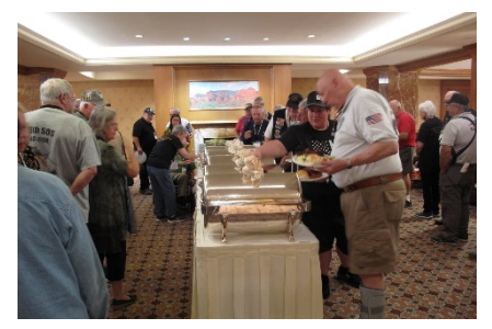
Meet & Greet Buffet Line