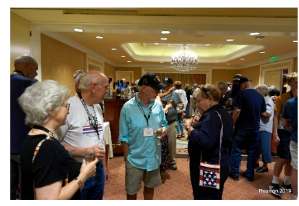
Meet & Greet