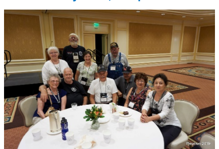
AC-119 Family & Friends