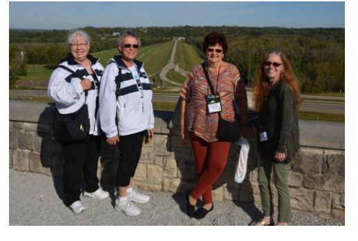
34 Panoramic vista - overview of historic sites