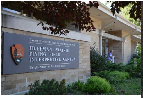
30 Wright Hill Memorial Site