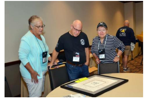
8 2nd yr. capturing attendees names on the "Brother Print"