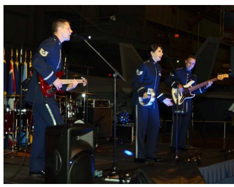
28 USAF Band