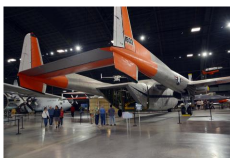
22 AC-119J Satellite Catcher