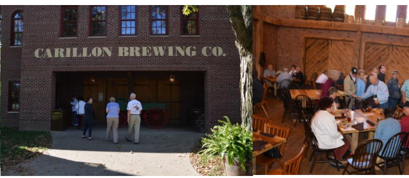
31" Pub Carillon Historical Park - "turn of the century