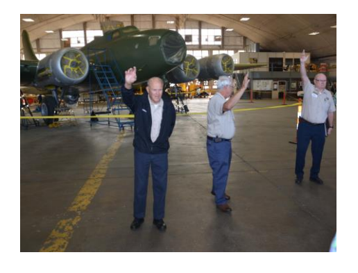
3. Tour Guides at Restoration Hanger