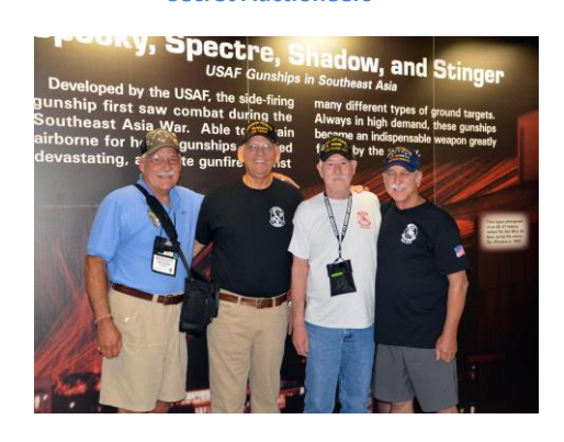
21 Associates in the Gunship Kiosk