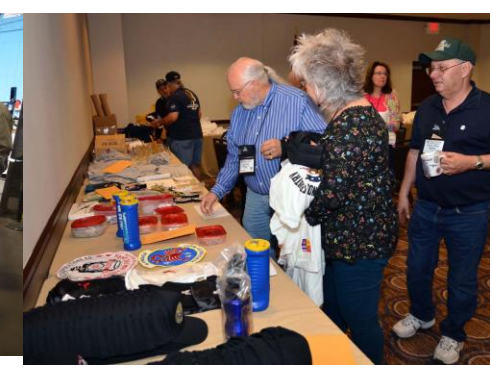
5 Quartermaster's - items for sale