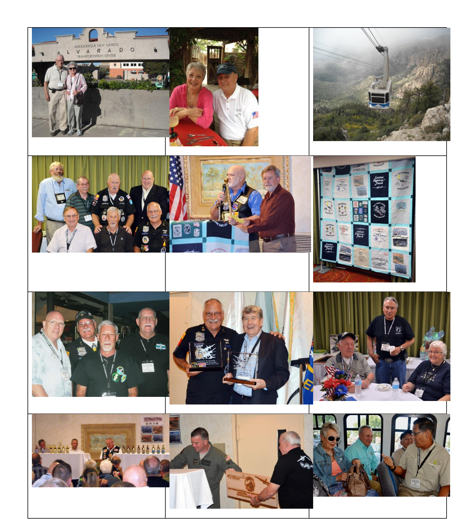
INTERESTING FINAL PAGE, DOWN ONE MORE!