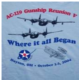
Reunion V T-Shirts