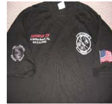
Reunion IV T-Shirts