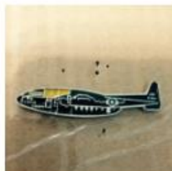
Hat Pins, Mouse Pads, License Plate Holders (13)