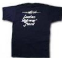
Shirts, Ascots, Ties, Vests (13)