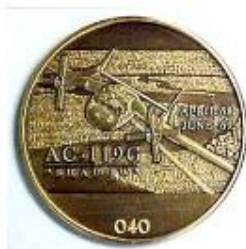
Challenge Coins (4)