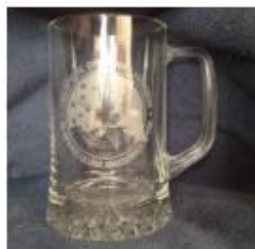
Cups, Mugs, Water Bottles (7)