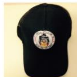
Squadron Hats (5)