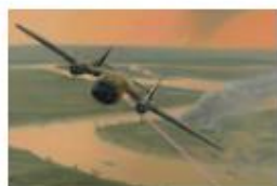
Lithos & Prints (5)