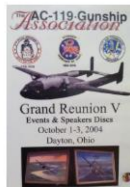
History Book, DVDs, CDs (5)