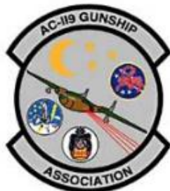
Patches & Decals (16)